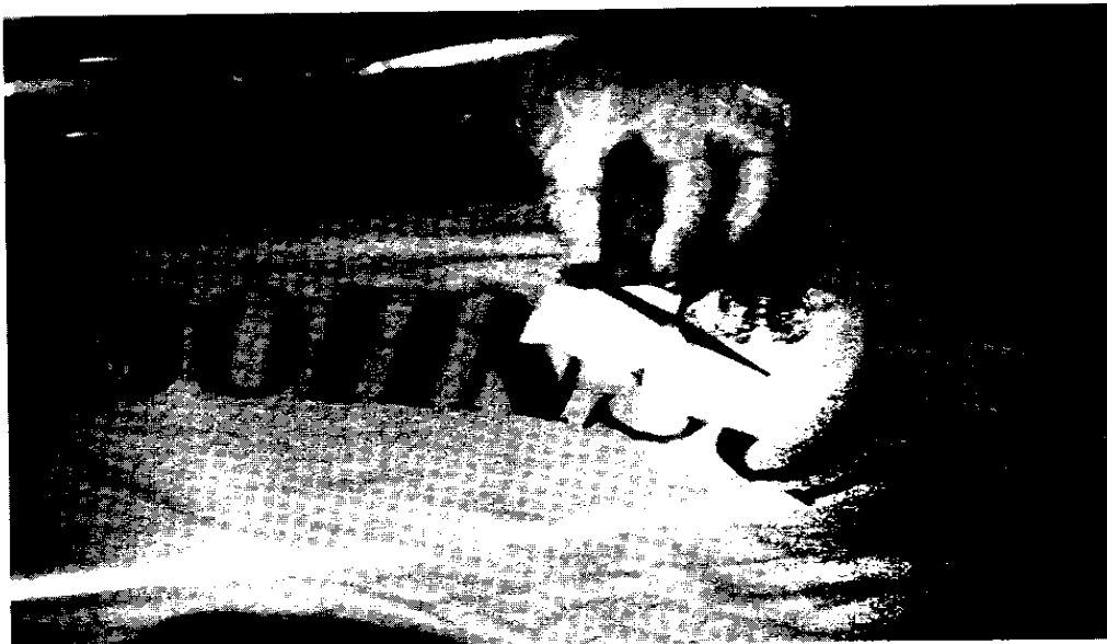
Figure 1. Detail of glove and consolidant set-up.