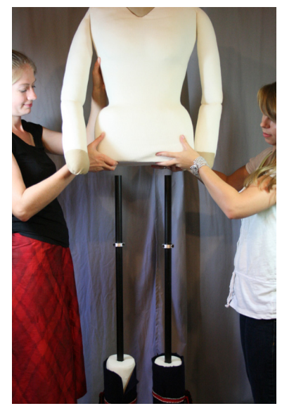
Figure 1 (left): An exhibition case at the National Air & Space Museum for "America by Air". Figure 2 (right): Dressing of the assemblage is made easy, as that the embedded armature easily and smoothly slides down the base posts.

An aspect that should not be overlooked is that this design separates talents and knowledge of the conservator and the metalsmith. This arrangement is found at larger institutions, but now those in smaller museums and in private practice can delegate or outsource this part of the process. The hope is that the design is successful to such a degree that an institution can mix and match components in order to display a wide variety of costume garments easily over the course of many exhibits.