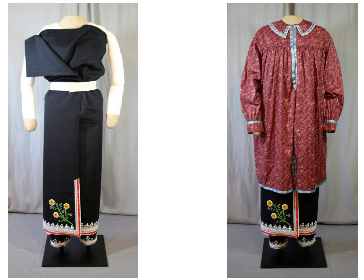
Figure 11: Buffalo & Erie County Historical Society Figure 11a (left): The elongated torso, Figure 11b (right): The wrapped skirt held in place with a cotton-webbing belt secured with Velcro.

For a re-creation of the Caroline G. Parker's Seneca garment from the Morgan collection, which has an over dress, wrap skirt and leggings, an elongated torso was used for both the skirt and dress (figs. 11a-b). By positioning the waist in the vertical tube region of the armature, like the Taffeta dress, plenty of room was available for the skirt's support. A wide cotton-webbing belt with Velcro fasteners was created.