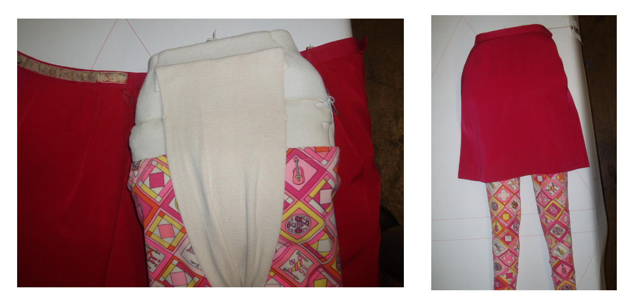
Figure 13: Tights: Figure 13a (top left): Supports for the tights and lower torso armature for the mini-skirt. Figure 13b (top right): Detail of the front face of the lower torso, Figure 13c (bottom left):. The supported tights in place with the stockinet diaper in position. Figure 13d (bottom right): The dressed lower torso before being positioned onto the base posts.