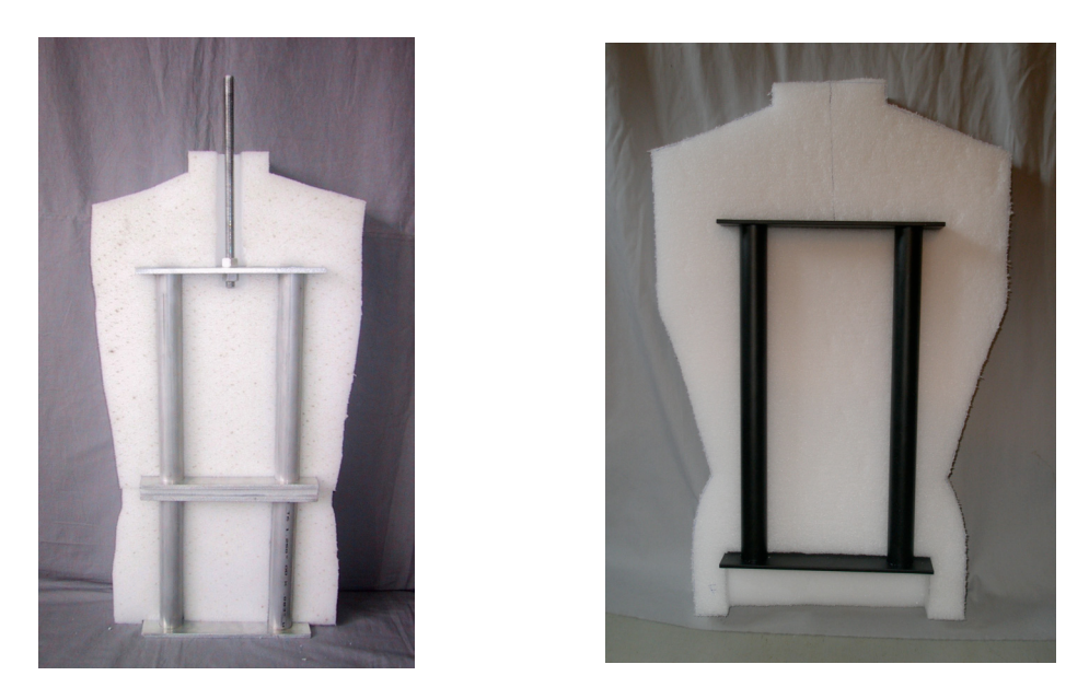
Figure 3a (left): Internal Armature embedded into the Ethafoam plank; Figure 3b (right): An elongated torso with stop-clamp access cavity.

The torso sections are stacked and slide up and down on the vertical posts or stands. They are supported in place with stop-clamps. The stop-clamp holds the internal armature at the desired height on the posts. Therefore adjustments can be made at any time and performed easily and smoothly (fig. 4b). The stop-clamps are sufficiently secure to the posts to enable numerous stacking torso components. A complicated garment might require several independent supports that could be stacked.