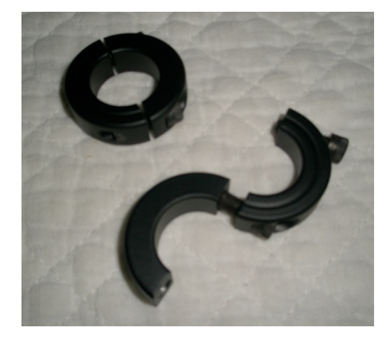
Figure 4b: stop-clamp