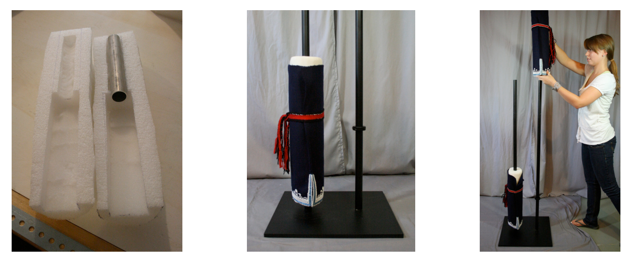
Figure 12: Leggings: Figure 12a (left): The cross-sections of the two halves of the Ethafoam supports. Figure 12b (middle): The supported legging positioned on the base post. Figure 12c (right): Placing the second legging onto the base

Legging supports were created by inserting a 2.5 cm (1 inch) diameter pipe into the legging support and a second set of stop-clamps. The pipes were embedded into two halves of the foam like the torsos. Ethaform® blocks were cut and then carved to the shape to fit the inside diameter of each legging, as seen in fig. 12.a. When it was time for dressing, the leggings were slipped onto the posts first, and then the upper torso were placed with its own set of stop-clamps. Had the leggings been taller necessitating a taller support, then only one set of stop-clamps would have been utilized (figs. 12a-c).