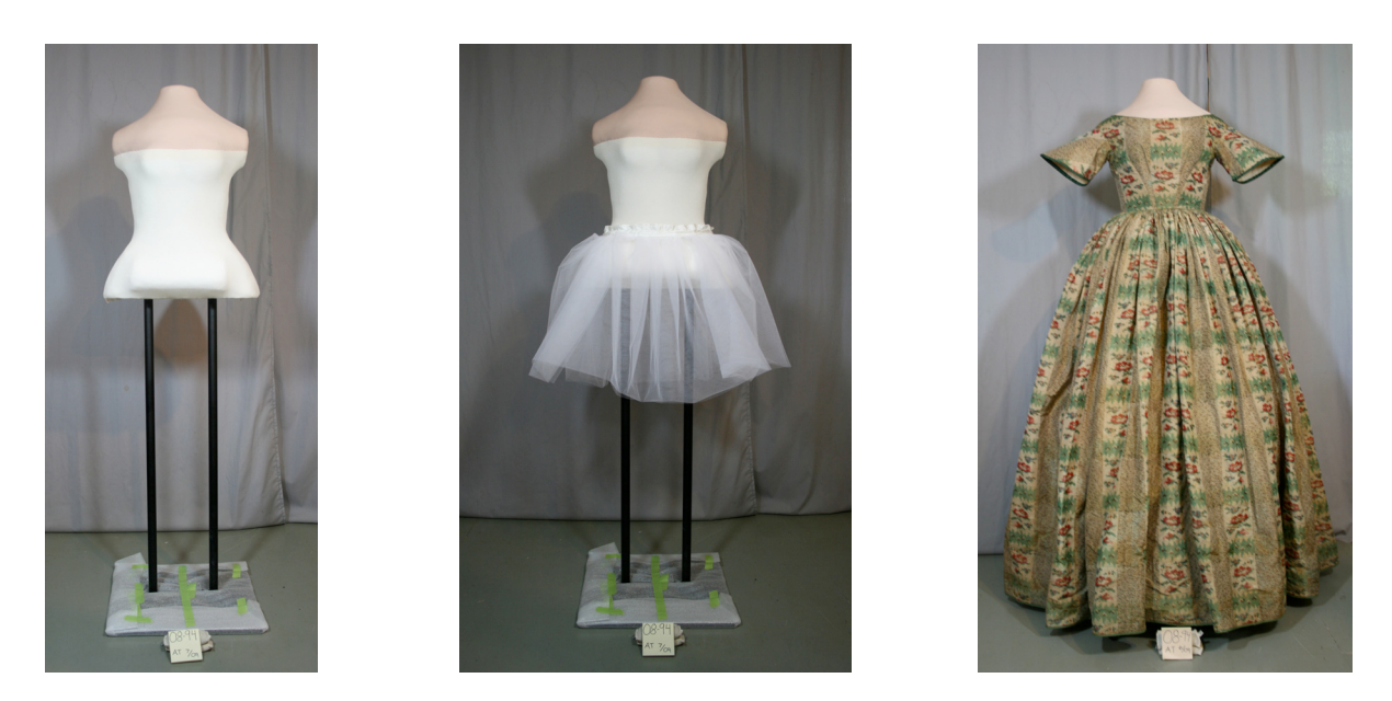
Figure 9: 1830s Taffeta Dress: Figure 9a (left): The elongated torso armature. Figure 9b (middle): Armature with first layer of soft supports. Figure 9c (right): Fully dressed armature

In the exhibition, Woven by the Grandmothers, at the National Museum of the American Indian's Geroge Gustav Heye Center, all of the form's armatures for Navajo wearing blankets were made of PVC pipe. (Spicer & Heald, 1997) Here the same chief pose for this Navajo blanket was created with this new armature (figs. 10a-c). The PVC pipes were ideal for this temporary exhibit. They too were the internal armatures that were embedded into the Ethafoam®. The wide variety of fittings added to the flexibility of postures and poses. However, this one venue exhibit became a ten-venue exhibit, traveling to North, Central, and South America. In hindsight a more robust armature would have been better suited, and the metal armature making delegated to another specialty source. The tight exhibition schedule for this project only allowed for a production situation where the conservators performed all tasks or fabricated all mounting elements.