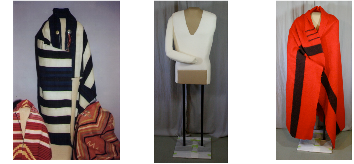
Figure 10: Woven by the Grandmothers: Figure 10 a (left): Forms on exhibition. Figure 10 b (middle): Mannequin form with rigid arm. Figure 10 c (right): Dressed mannequin.

In the exhibition, Woven by the Grandmothers, at the National Museum of the American Indian's Geroge Gustav Heye Center, all of the form's armatures for Navajo wearing blankets were made of PVC pipe. (Spicer & Heald, 1997) Here the same chief pose for this Navajo blanket was created with this new armature (figs. 10a-c). The PVC pipes were ideal for this temporary exhibit. They too were the internal armatures that were embedded into the Ethafoam®. The wide variety of fittings added to the flexibility of postures and poses. However, this one venue exhibit became a ten-venue exhibit, traveling to North, Central, and South America. In hindsight a more robust armature would have been better suited, and the metal armature making delegated to another specialty source. The tight exhibition schedule for this project only allowed for a production situation where the conservators performed all tasks or fabricated all mounting elements.