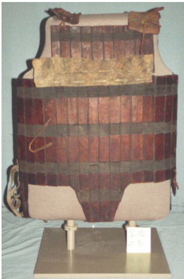
Figure 8: Alaskan Armor on a short-style base, designed to fit into a display case and bonnet.

Wood armor from Alaska that measured 28" H was supported with a tabletop-sized armature designed to fit in a small display case or other limited space restrictions. The in-the-round display case allowed the visitor to closely inspect the artifact. The armor had previously been displayed flat high up on a wall, where it could not be easily seen. The armor's support consisted of a single torso section and base with short posts. The base was powder coated to match the case creating a sleek design (fig. 8). The posts were made the exact inside height of the internal armature.